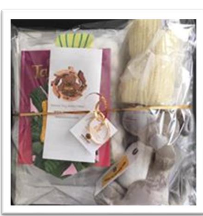
Kangaroo Care Pack